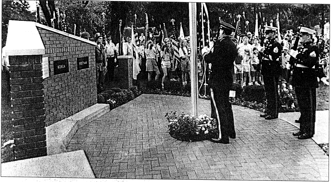
An honor guard prepares to raise the flag at the Winfield war memorial.